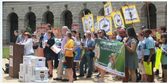
Members stand up for bees at EPA headquarters in Washington, DC.

As you know 2017 is already shaping up to be one of the most challenging years we've ever faced.