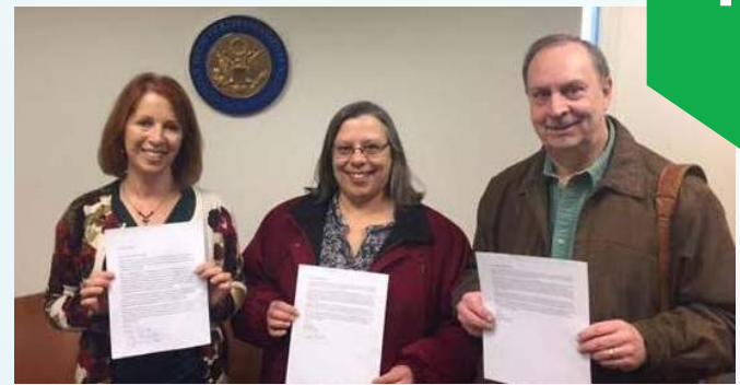
Members sign petitions to RESIST Trump in their community.

With you at our side, we can continue to achieve pivotal victories for the Earth and all who call it home no matter the challenges ahead.