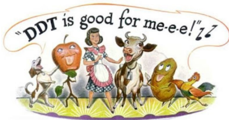
Industry has often claimed that chemicals are perfectly safe when overwhelming scientific evidence has eventually proven otherwise.

has recently listed the chemical as a probable human carcinogen. 109 And the U.S. Geological Survey, which recently concluded that glyphosate is widespread in our nation's air and water, has noted that "many studies indicate that commercial glyphosate formulations can be more toxic than pure glyphosate due to the toxicity of additives, such as surfactants (detergents)." 110 Many experts,