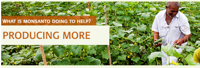
Screenshot from Monsanto.com (March 2015)

The Spin: From Monsanto's website to the op-ed pages of the biggest media outlets, the biotech industry promotes the message that GMOs are essential to feeding the world's growing population, largely based on the claim that biotech crops increase yields and use fewer resources.